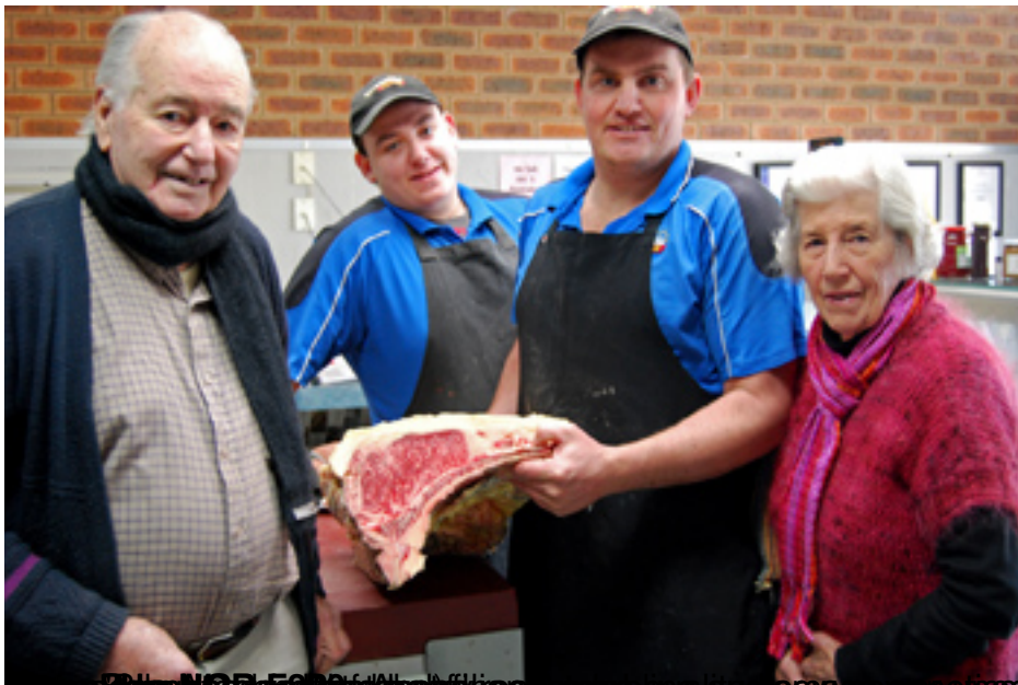
Dillon's Carcass at World's Best Beef Competition